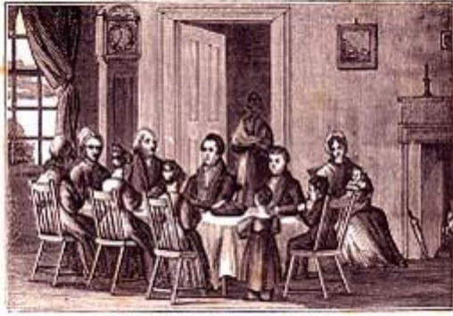
Thanksgiving Dinner. P. 36.