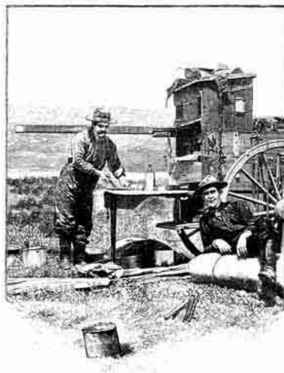
1888 "With the Cowboys – Preparing for Thanksgiving: Making Pies."

and a gathering of family and friends, giving thanks for the bounty of the year.